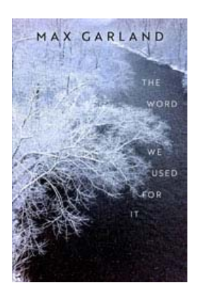
The Word We Used For It